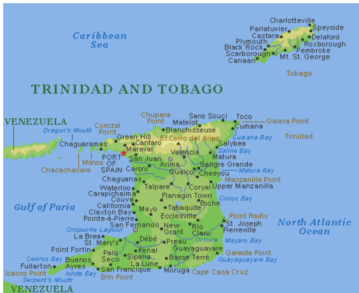
Map of Trinidad and Tobago