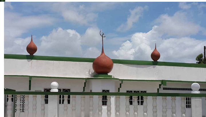
Iere Village Islamic Mosque, TT National Trust ▲