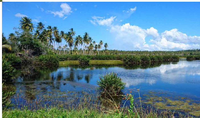
Great Icacos Lagoon, TT National Trust ▼

Visit the ruins of the WWII US Army Bunker at Green Hill, the 4km stretch of beach at Columbus Bay, and the Great Icacos Lagoon, an estuarine basin mangrove of approximately 330 hectares. This tour takes 8 hours.