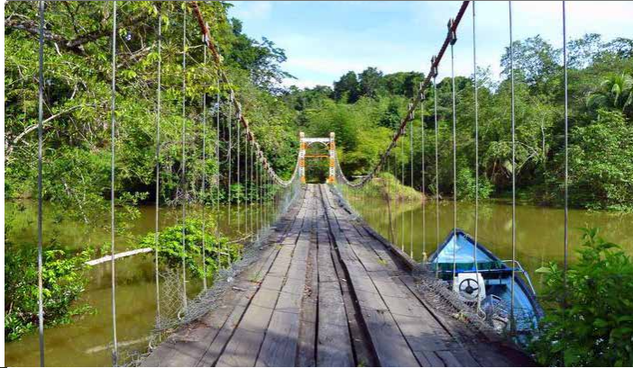
Moruga River ▼

This fishing village on south side of Trinidad is filled with attractions for people who like sightseeing. Visit Punta de la Playa, the Christopher Columbus monument, the iconic Baily Bridge and more. This tour takes 8 hours.