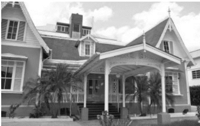
George Brown House