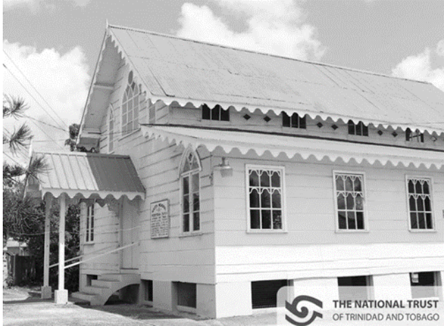
Morton Memorial Presbyterian Church