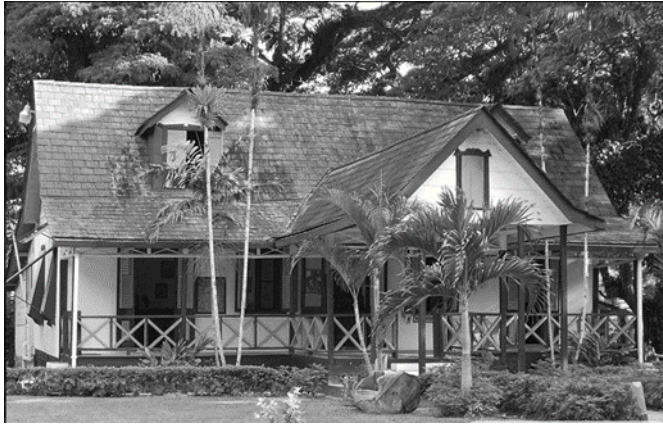
Lopinot Historical Complex