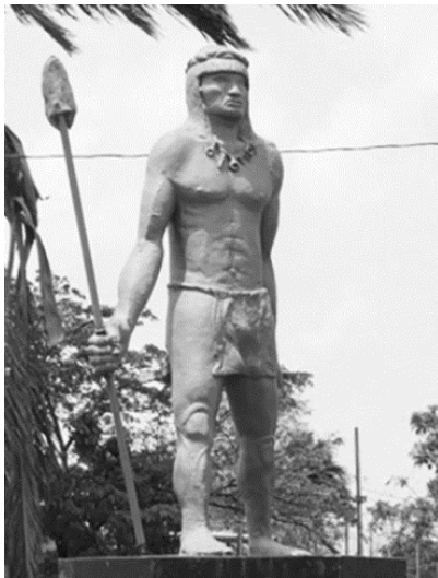
Statue of Hyarima